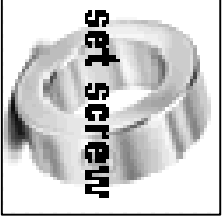
RELEASE COLLAR DETAIL

ROTATING RELEASE MECHANISM IS MADE OF 7/16" THREADED ROD, JAM NUTS, LOCK WASHERS, AND THE VARIOUS ALUMINUM BAR STOCK SHAPES 3 PLCS \phi \frac{5}{32} 2 0.75 SPRING LEVERS 0.062 4X